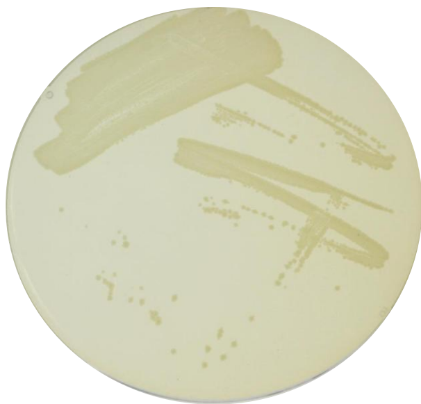
Salmonella typhimurium ATCC 14028 (≥10 9 CFU)